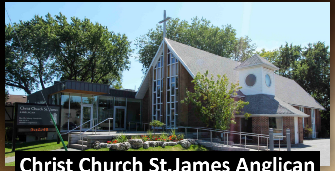
Christ Church St. James Anglican