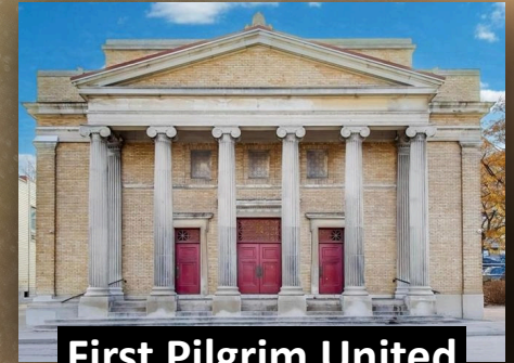
First Pilgrim United

This quarter, Friends of Dismas would like to celebrate the many faith communities who generously host Fellowships across the province. These relationships are one of the key factors in the continued success of the Fellowship Network and we are grateful for the generosity of both prayer and space from Church leaders and their flocks.