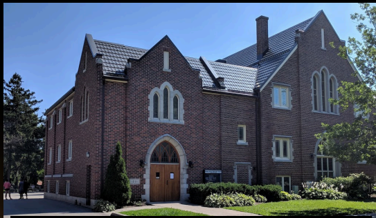
Stirling Avenue Mennonite