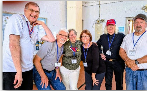
Some of the Dismas Leadership Team